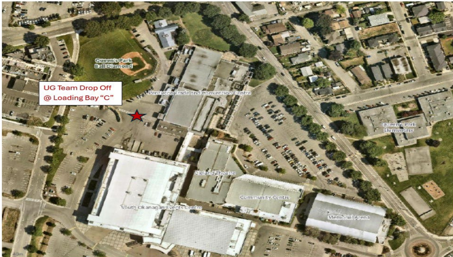
Map 2 – UG Team Drop off/Lock-up (Penticton Trade and Convention Center)