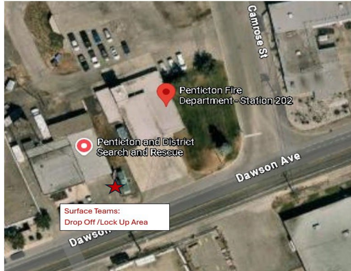
Map 3 – Surface Team Drop off/Lock-up (Penticton Search and Rescue Center)